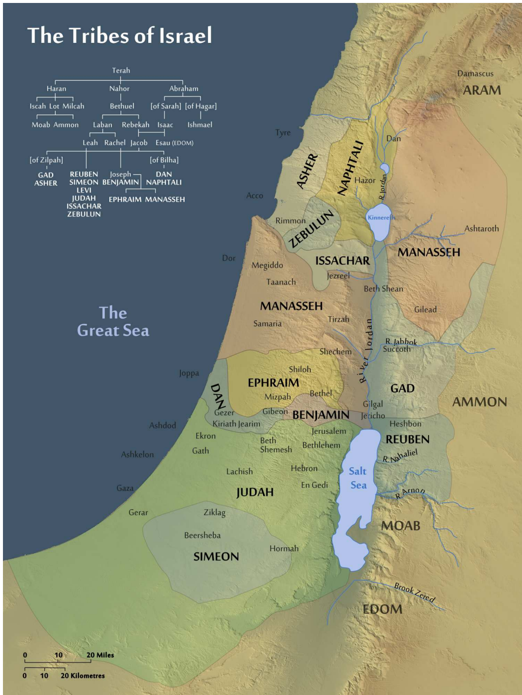
The Tribes Of Israel