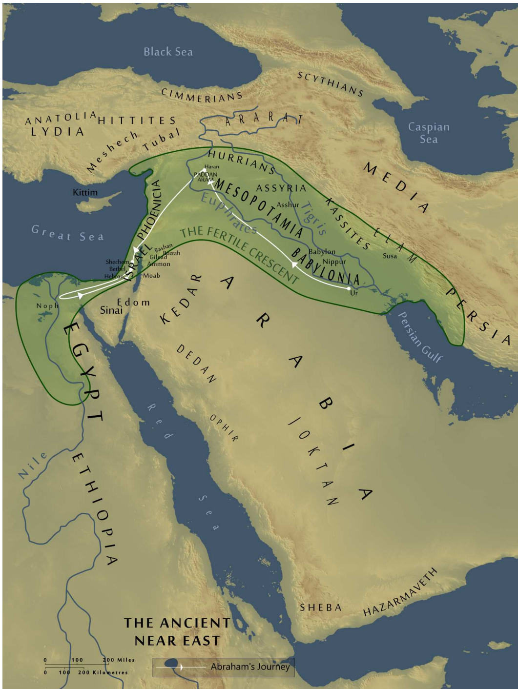
The Ancient Near East